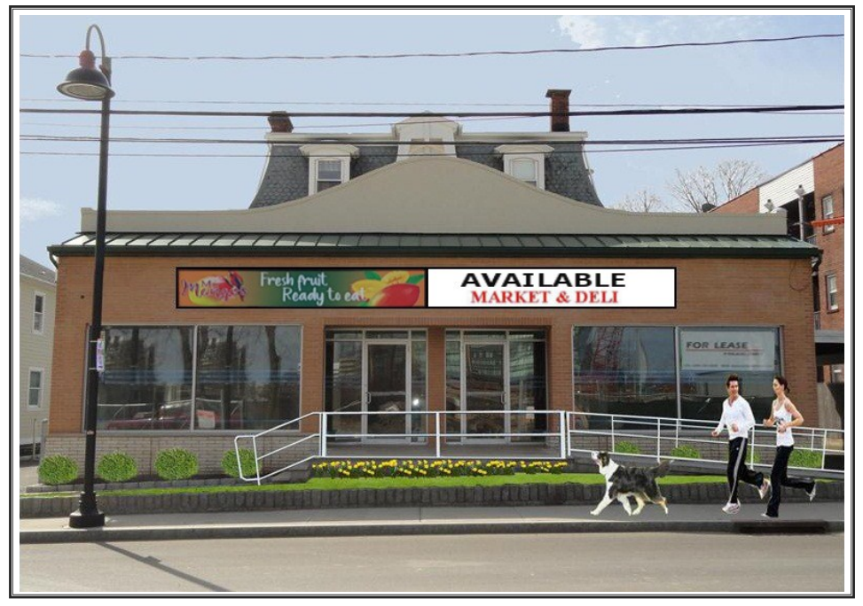
9 Pulaski Street, Stamford ... Don't Miss This Opportunity!