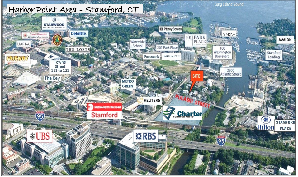
9 Pulaski Street .... Blocks from New Luxury Apartments and Office Towers