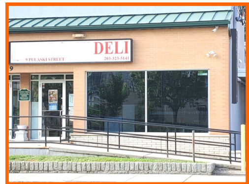
9 Pulaski Street, Stamford, CT

PARKING: On site parking for 16 vehicles with a wrap-around drive.