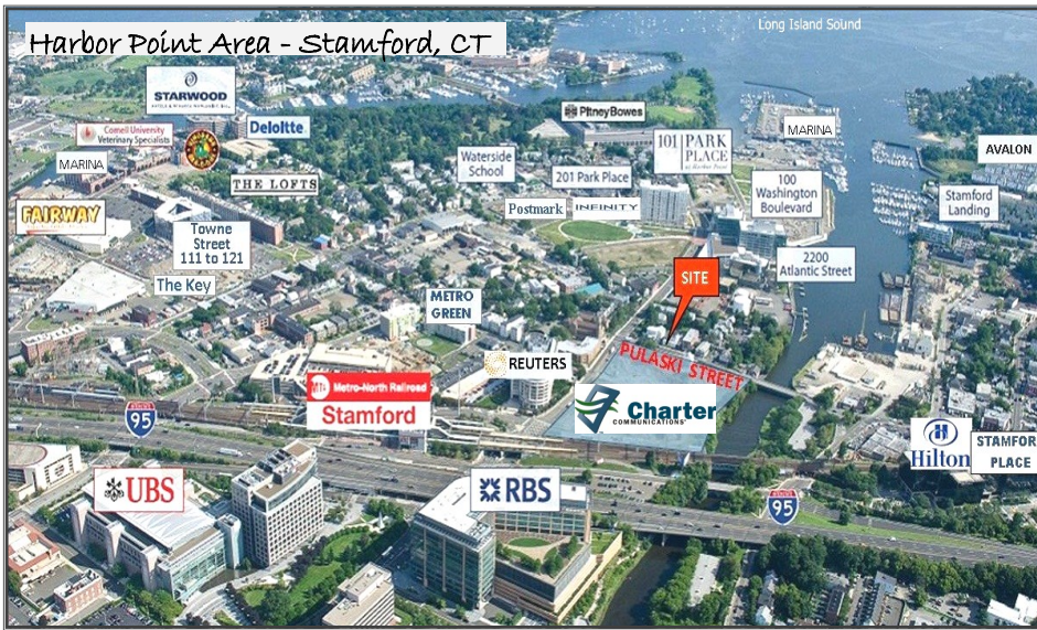
9 Pulaski Street .... Blocks from New Luxury Apartments and Office Towers