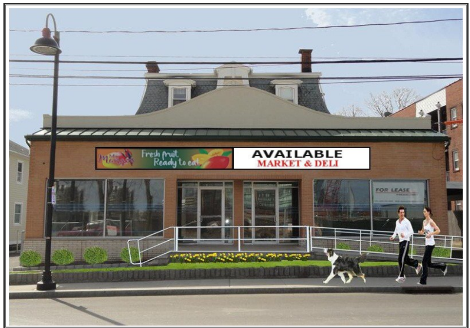
9 Pulaski Street, Stamford ... Don't Miss This Opportunity!