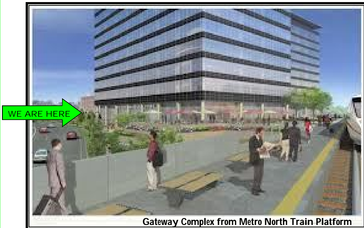
Gateway Complex from Metro North Train Platform