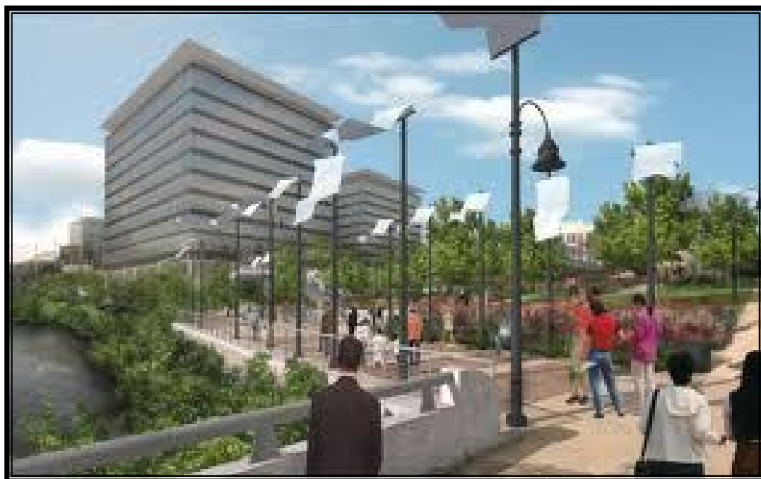
Pulaski Street Entrance to Public River Walk